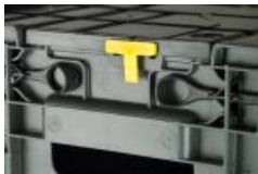
1811840 - Sealing clip for Prelog CMB