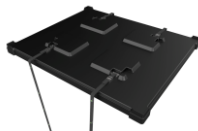
6017833 - Pallet Cover 1229x1030x84 - corner & straps