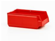
9068000 - System 9000 Modular Bin 400x230x150