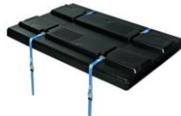
6015833 - Pallet Cover 1205x808x94