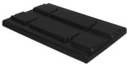
6015830 - Pallet Cover 1205x808x94 (A1208) (A1208) - straps