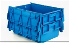
1325835 - Seals Integra (Set of 100)